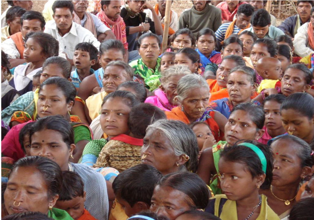
Village Meeting in Progress

Social security schemes for the most vulnerable were also mobilized by the VDC and federations. Some of them are: