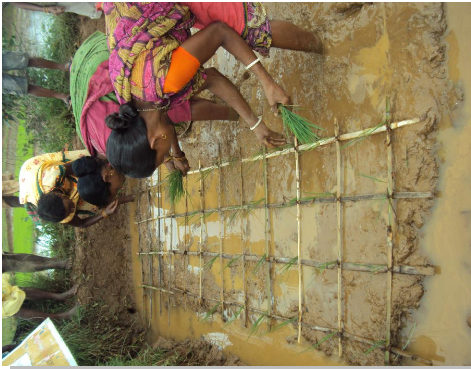
TRAINING ON SRI PADDY CULTIVATION TO WOMEN FARMERS