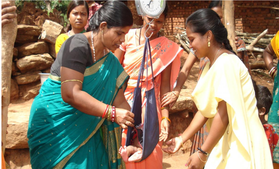
Weighing of Infants in Progress

other locations staff continued to work on malaria prevention, monitoring immunisation and child care at the Anganwadis. This year 216 orientation meetings, 17 adolescent screenings, facilitating 318 institutional deliveries, attending 324 VHND sessions, immunization of 1229 women/children etc., has also been done.