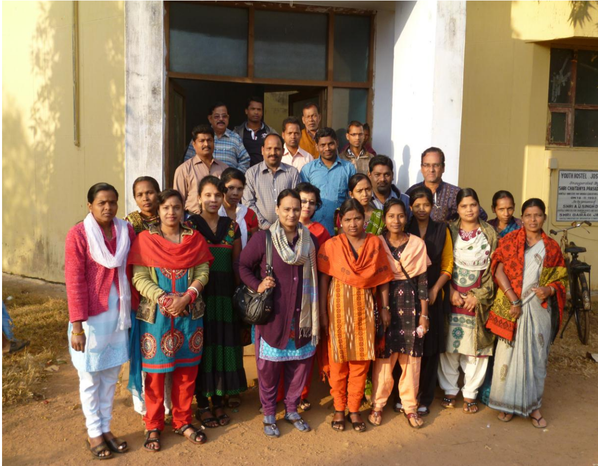
Exposure to DULAL, BARIPADA

addition at Bhubaneswar. They also got exposure to Swaminathan Research foundation, OUAT etc., to get hands on experience on organic farming, indigenous seeds regeneration, mixed and inter cropping etc.,