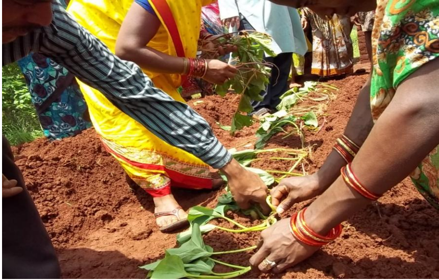
ORANGE SWEET FLESHED POTATO PLANTATION TRAINING